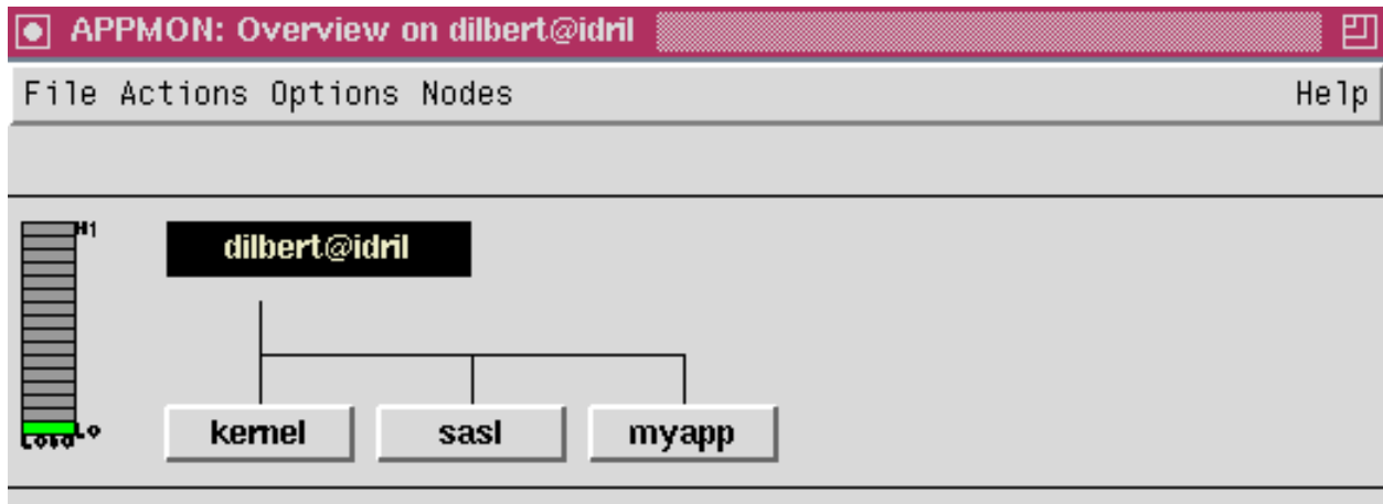
Figure 1.1: The Main Window.

The load meter shows load measured as processor time, or as the length of the ready queue.