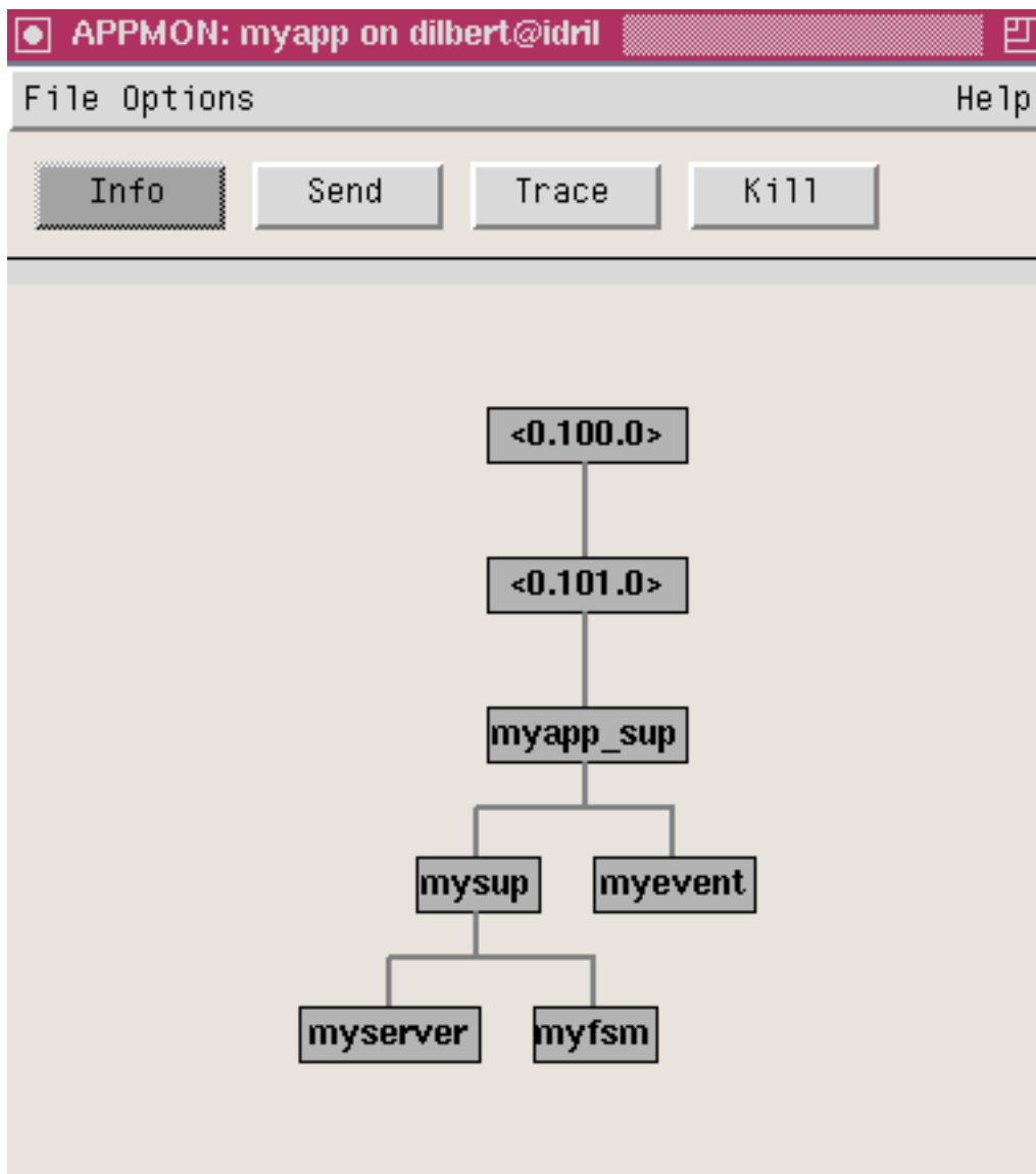
Figure 1.2: The Application Window.

The application can be shown either as a strict supervision tree, or as a process view with all linked processes. In supervision mode, the tree-gathering and -building algorithm assumes conformance to the OTP design principles.