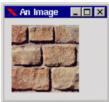
Figure 8.7: Canvas Image Object

The canvas image object displays images and moves them around in a simple way. The currently supported image formats are bitmap and gif.